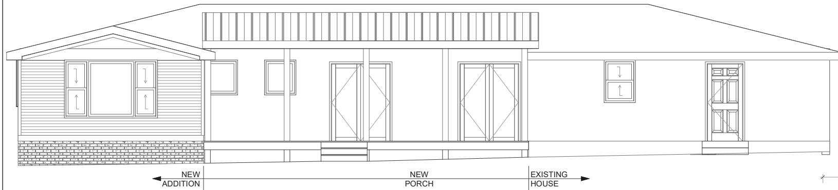
3 NORTH ELEVATION SCALE: 1/4" = 1'-0"