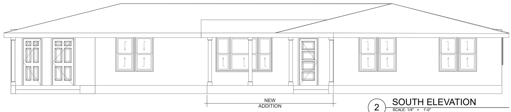
2 SOUTH ELEVATION SCALE: 1/4" = 1'-0"

ELIZABETH DUNAY DESIGN 366 PLAINVILLE RD NE ROME, GEORGIA 30161 PH_706 766-0366 bdunay@bellsouth.net